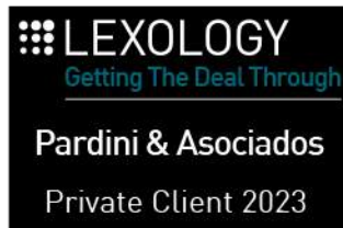
Lexology Private Client 2023