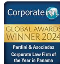
Corporate Law Firm of the Year 2024