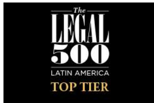
The Legal 500 Top Tier 2024

Pardini & Asociados is a Panama multi-disciplinary law firm, where our clients, transactions and awards are our best introduction. With 40 years of tradition and experience advising foreign clients and corporations of all sizes, we are your best choice for legal solutions. The law firm has received the following awards during the last years: