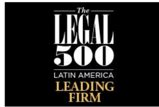
The Legal 500 Leading Firm 2024